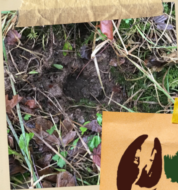
☆ The Kielder Brag hoof print