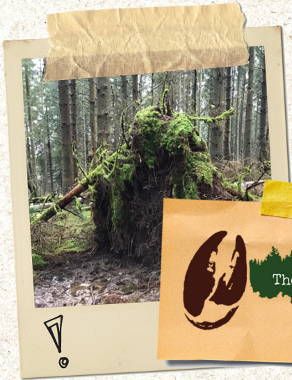
! Trees knocked over by the Kielder Brag