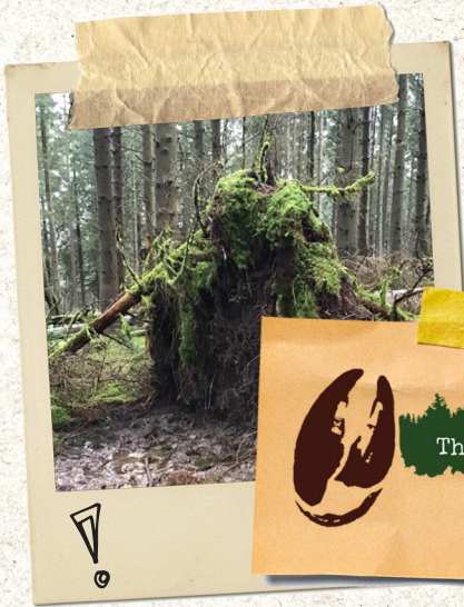
! Trees knocked over by the Kielder Brag